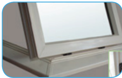
Sill support blocks locate panel onto sill.